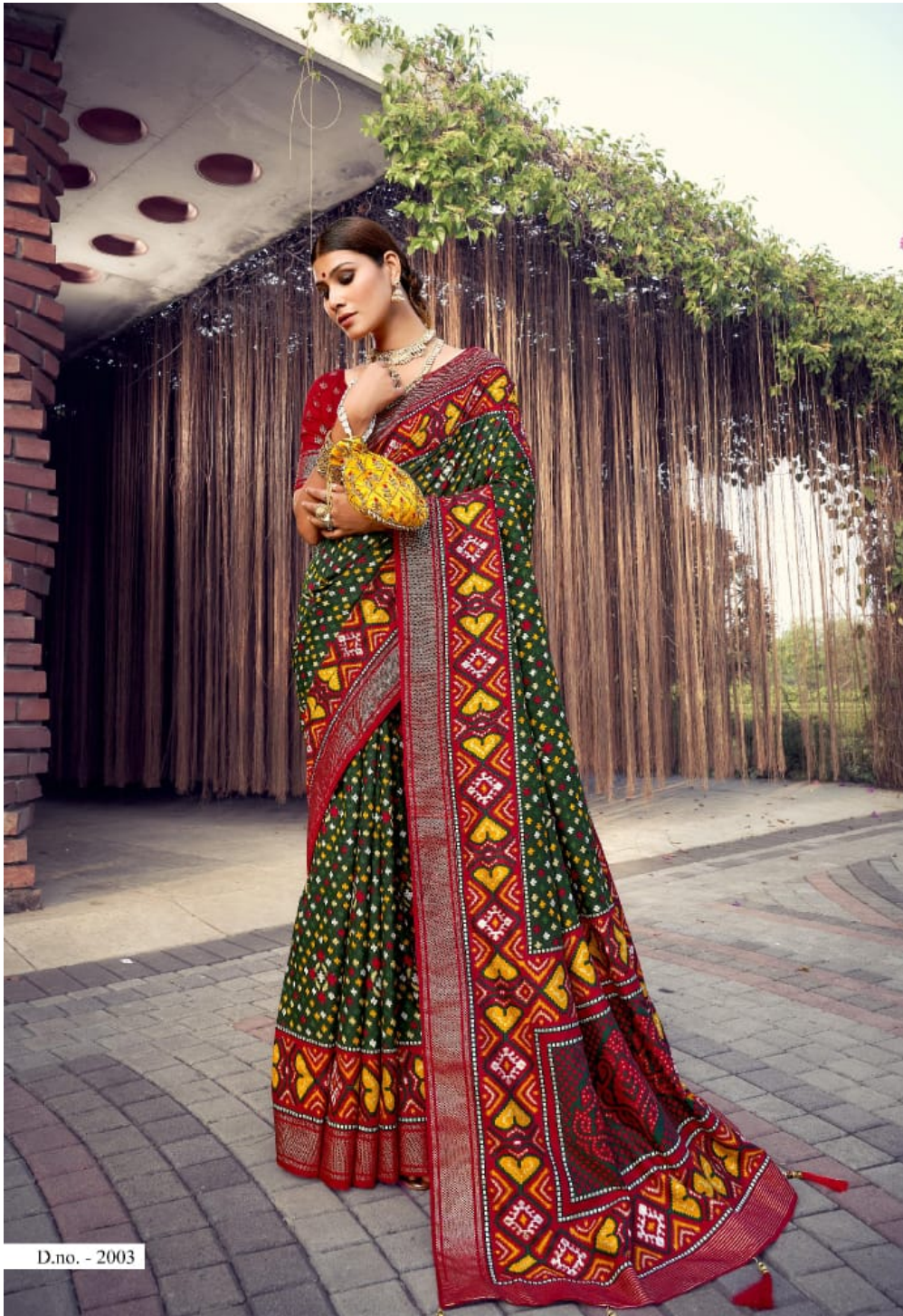
D.no. - 2003