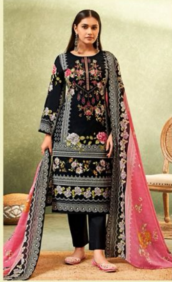
Naysa | 822-02