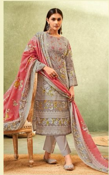
Naysa | 822-08