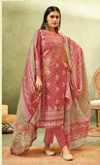
Naysa | 822-06