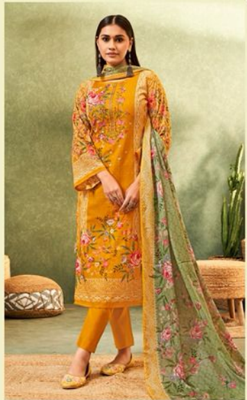
Naysa | 822-05