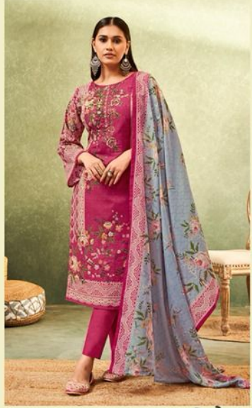
Naysa | 822-01