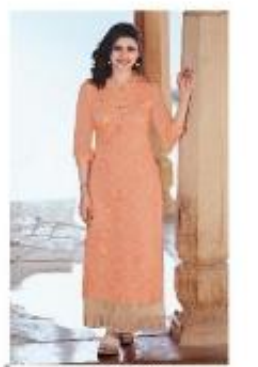
| 38407 |