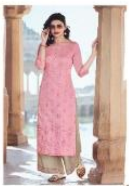
| 38404 |