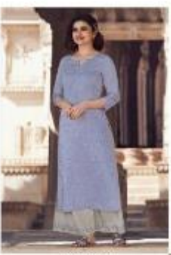
| 38408 |