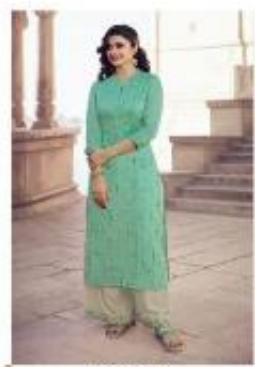
| 38403 |